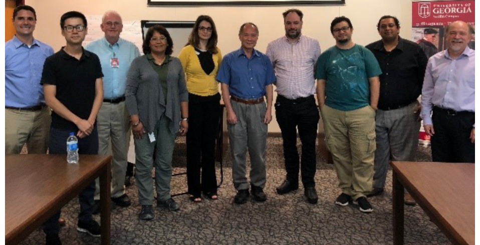
CFS faculty at 2019 strategic planning session

The CFS tradition of organizing its prestigious CFS Annual Meeting continued in March 2020. This year, the new version of this by-invitation day and a half small conference was held at the Atlanta Airport Marriott on March 3 and 4. Despite the initial concerns with the COVID-19 pandemic emergency, more than 170 attendees from all segments of the food industry and government were able to participate and engage in the latest food safety issues. The topic of COVID-19 in relation to food risk was one of the highlights of the meeting. After the Annual Meeting, the CFS faculty has been actively involved in outreach with industry and government stakeholders as well as initiating valuable research to address multiple questions of relation of this new virus to the food supply.