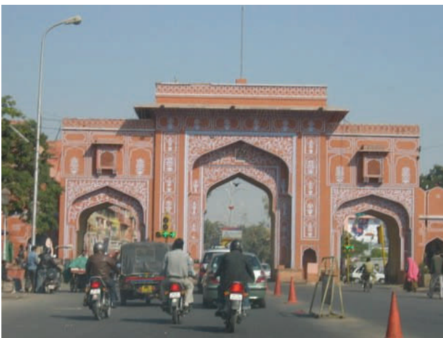
Scene from Jaipur, known as India's Pink City.

tea plantations thrive. They learned how tea is grown and processed and tasted hand-rolled tea. One tea they sampled was the expensive silver leaf tea made from unopened tea leaves found at the very tip of the stem. The leaves are harvested by workers before daybreak using miners' hats to see the leaves to be picked. The Toledos also toured vanilla bean and pepper plantations and found the processing of these condiments to also be very interesting.