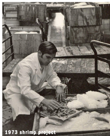
1973 shrimp project