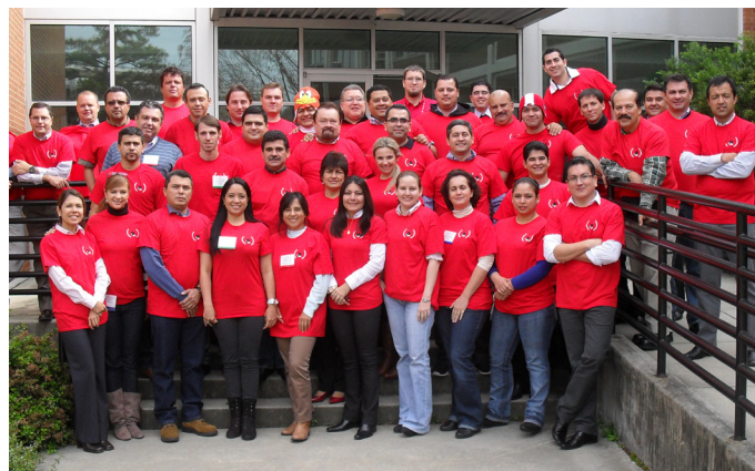
Attendees of the EFS workshop, “Poultry School en Español.”

We also want to thank the Food Science Club volunteers for providing catering services for all of the EFS workshops! We couldn't have done it without them!