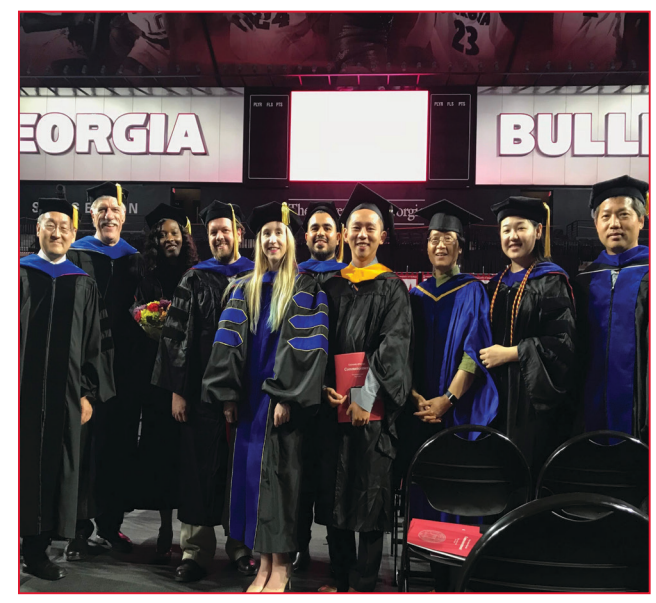
Food Science graduates at the Graduate Student Spring 2018 Commencement Ceremony