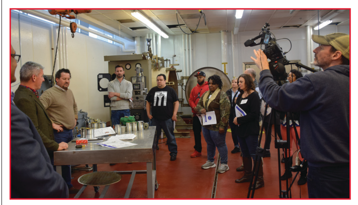
Demonstration to attendees at UGA Food Science Extension's March course 'Better Process Control School'. The videographer is filming for the upcoming online course.

2018 has proven to be a big year so far for UGA Food Science and Technology Extension! Starting in February, Extension held its first of several workshops. Because demand for online courses has become greater, Extension brought in a team of videographers to film their 'Better Process Control School' short course in March. It was a learning experience for everyone, and the first online course from Extension will debut later this year.