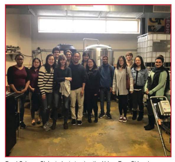
Food Science Club students touring the Urban Tree Cidery in Atlanta, GA.

One of the goals of the Food Science Club this year was to increase the amount of interactive activities at meetings. Our first meeting was on National Coffee Day. At the meeting we discussed how coffee is harvested and brewed. We also had a short introduction to sensory science, including different sensory analysis tests and how to develop a flavor profile of a coffee sample. Members tasted locally brewed and chain coffees, performed a hedonics sensory test, and developed flavor lexicons of the coffees tasted. We also promoted one of UGA's study abroad opportunities, Costa Rica: From Bean to Cup. Another activity at one of our meetings was learning about the science of sugar. Members made their own sugar bowls and rock candy and discussed the science behind making