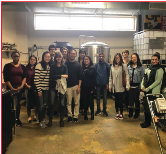
Food Science Club students touring the Urban Tree Cidery in Atlanta, GA.

One of the goals of the Food Science Club this year was to increase the amount of interactive activities at meetings. Our first meeting was on National Coffee Day. At the meeting we discussed how coffee is harvested and brewed. We also had a short introduction to sensory science, including different sensory analysis tests and how to develop a flavor profile of a coffee sample. Members tasted locally brewed and chain coffees, performed a hedonics sensory test, and developed flavor lexicons of the coffees tasted. We also promoted one of UGA's study abroad opportunities, Costa Rica: From Bean to Cup. Another activity at one of our meetings was learning about the science of sugar. Members made their own sugar bowls and rock candy and discussed the science behind making