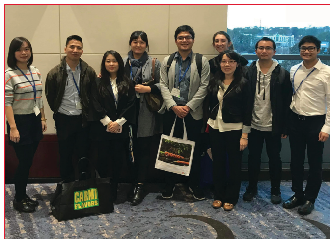
Food Science Club students attending and volunteering at the SEIFT Expo at the Cobb Galleria Center in Atlanta in February