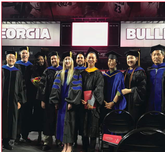
Food Science graduates at the Graduate Student Spring 2018 Commencement Ceremony