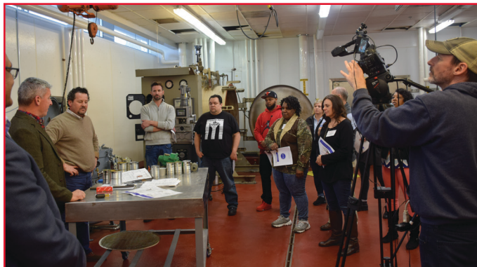
Demonstration to attendees at UGA Food Science Extension's March course 'Better Process Control School'. The videographer is filming for the upcoming online course.

2018 has proven to be a big year so far for UGA Food Science and Technology Extension! Starting in February, Extension held its first of several workshops. Because demand for online courses has become greater, Extension brought in a team of videographers to film their 'Better Process Control School' short course in March. It was a learning experience for everyone, and the first online course from Extension will debut later this year.