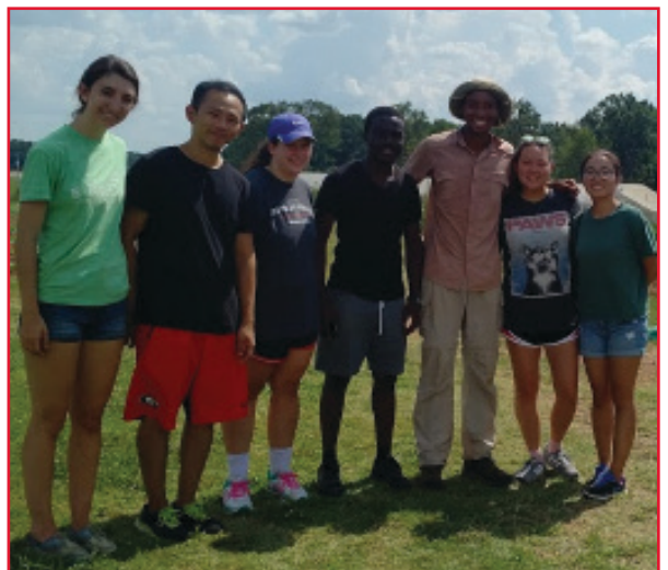
Food Science Club students volunteering at the UGArdens student community farm