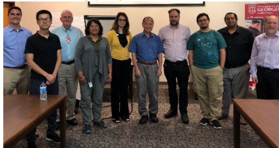
CFS faculty at 2019 strategic planning session

The CFS tradition of organizing its prestigious CFS Annual Meeting continued in March 2020. This year, the new version of this by-invitation day and a half small conference was held at the Atlanta Airport Marriott on March 3 and 4. Despite the initial concerns with the COVID-19 pandemic emergency, more than 170 attendees from all segments of the food industry and government were able to participate and engage in the latest food safety issues. The topic of COVID-19 in relation to food risk was one of the highlights of the meeting. After the Annual Meeting, the CFS faculty has been actively involved in outreach with industry and government stakeholders as well as initiating valuable research to address multiple questions of relation of this new virus to the food supply.