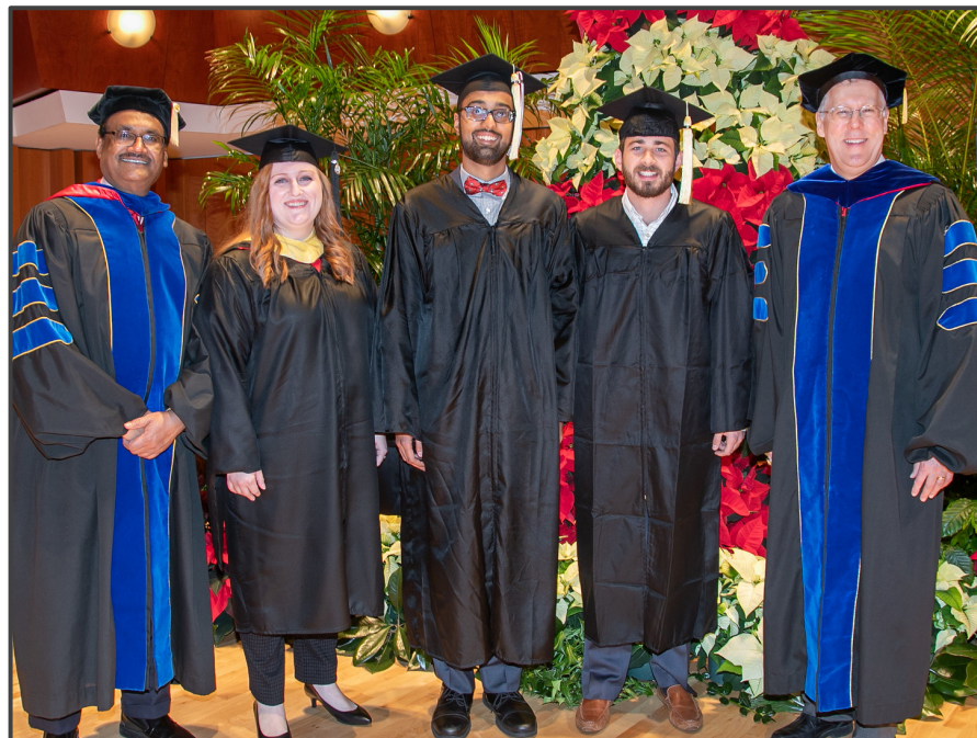
CAES Convocation Ceremony with a few of the Fall 2019 Food Science graduates